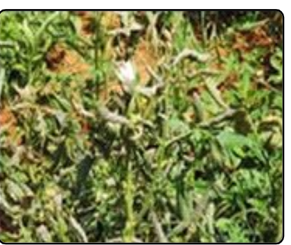
Severe Curling, puckering of >75%leaves (EC 676790)