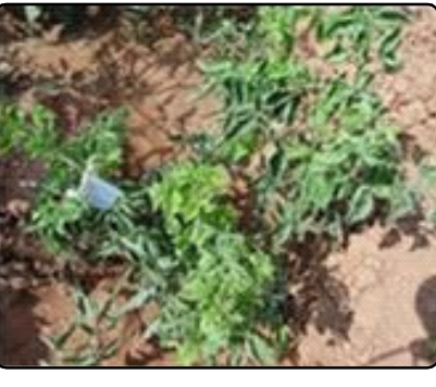
Stunted growth (LA1311-14)