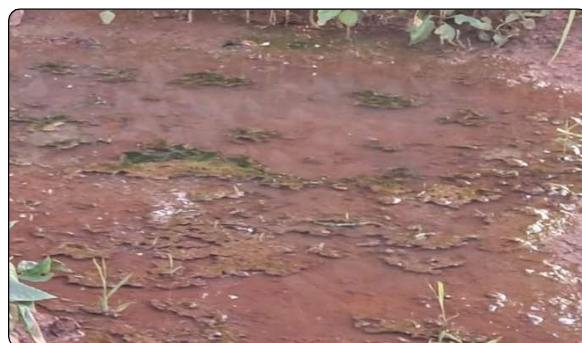
T 4 : Flumioxazin 50%SC @125 g a.i. ha -1 (PE)