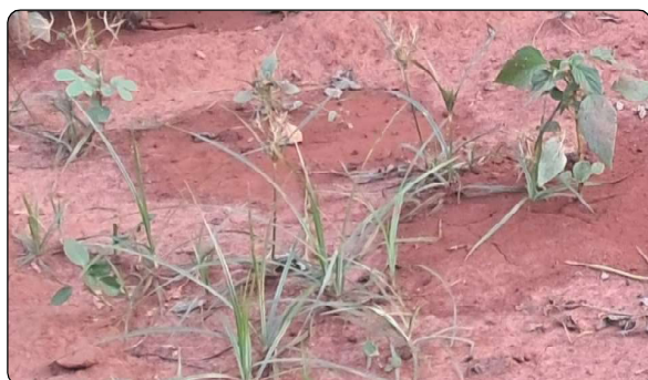
T 2 : Oxyfluorfen 23.5EC @70.5 g a.i. ha -1 (PE)

Herbicide application exhibited profound influence on germination and plant stand of the chia crop. Among the various herbicides applied, pre-emergent application of Pendimethalin 38.7 CS @750g a.i. ha -1 showed slight crop toxicity and persisted till 15 days after herbicide application (DAHA) and later recovered. Metribuzin 70 WP @ 210 g a.i. ha -1 showed slightly discoloration at initial days after herbicide application (5 DAHA), which was persistent and later crop recovered from the toxicity. Oxyfluorfen 23.5 EC @ 70.5 g a.i. ha -1 (PE) and Flumioxazin 50 SC @ 125 g a.i. ha -1 (PE) showed severe phytotoxicity by inhibiting germination with very few plants alive. (Plate 1).