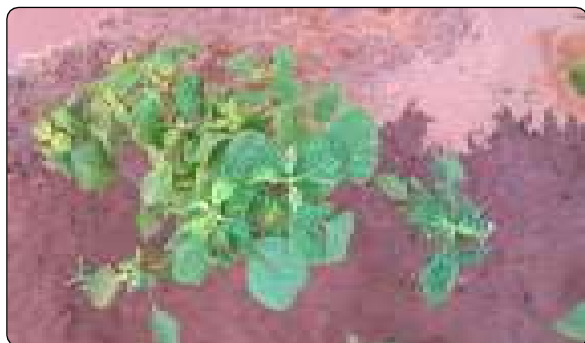
T 14 : Fluazifop-p-butyl+fomesafen 22.2% @ 250 g a.i. ha -1 (PoE)