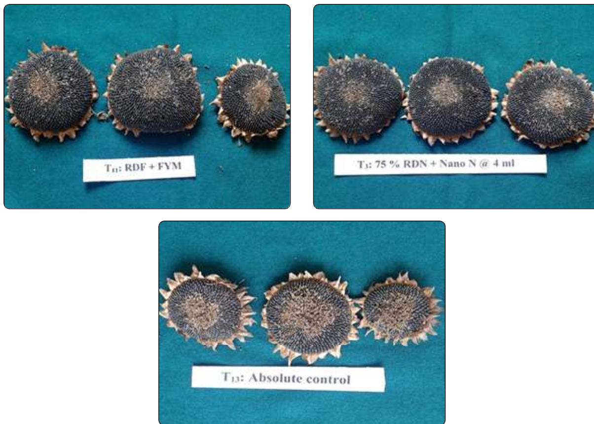
Plate 1 : Comparison of yields of sunflower in different treatments