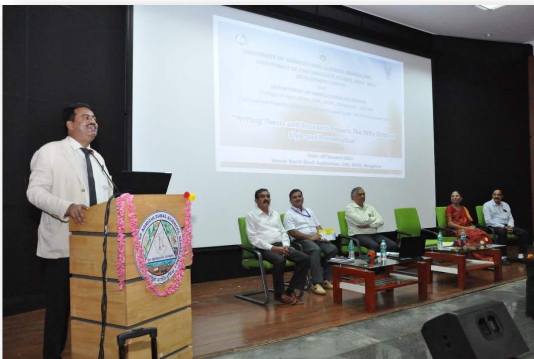
Vice-Chancellor addressing the gathering