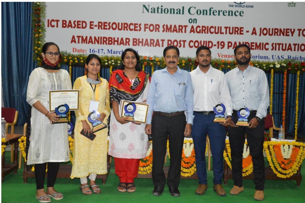
Ph.D. students, Department of Agricultural Extension, CoA, UAS, GKVK, received Bet Oral / Poster Presentation Award National Conference on ICT based e-resources for smart agriculture – A Journey Towards Atmanirbhar Bharat Post COVID-19 Pandemic Situation organized by UAS, Raichur under (NAHEP-IG) held during 16-17 March 2021.