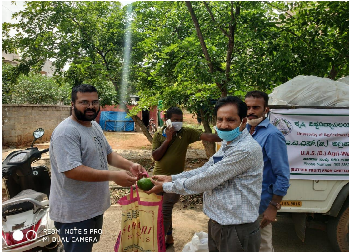
v. Direct marketing of Avocado (Butter fruit) through Agri War Unit, UAS, Bangalore on 27.04.2020 at Judicial Layout, Bengaluru.