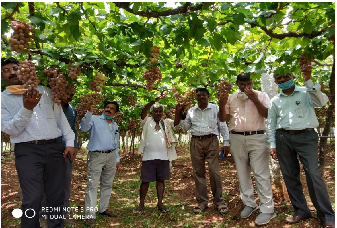
vi. Visited Red globe grape farmer field as a Member of Agri War Unit, UAS, Bangalore at Shidlaghatta on 07.05.2020