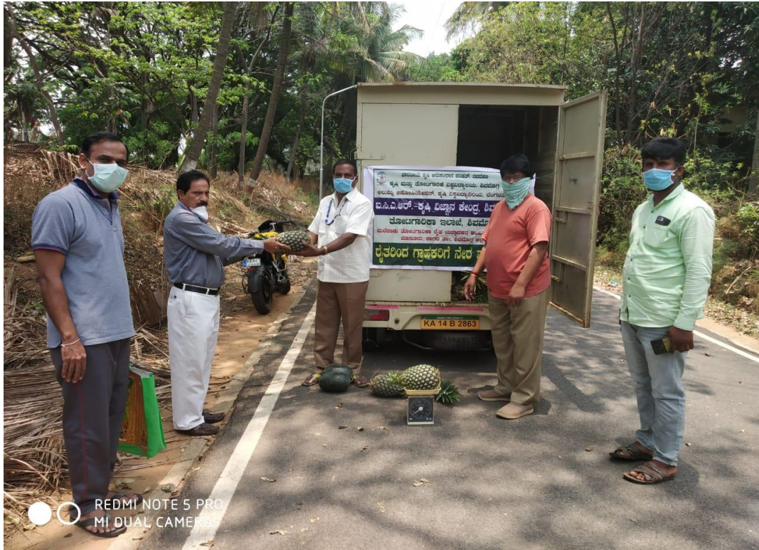
iii. Direct Marketing of Watermelon and Pineapple at Hebbal Campus on 18.04.2020 as a part of Agri. War Unit, UAS, Bangalore.