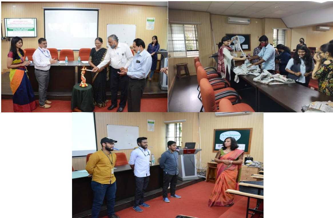
Communication and Personality Development Skills on 31.12.2020