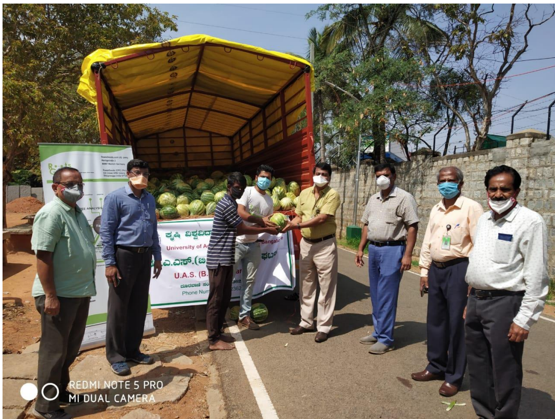
iv. Direct Marketing of Watermelon at Hebbal Campus on 28.04.2020 through goods, Hon'ble Vice-Chancellor was distributing the fruits.