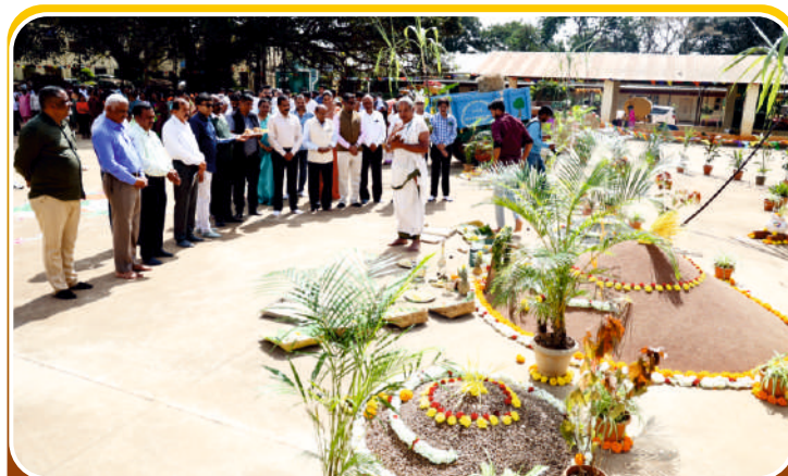
'Rashi Pooja' performed during 'Suggi Habba' on 13 th January, 2025 at Farm Section premises of ZARS, GKVK, Bengaluru