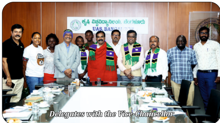
Delegates with the Vice-Chancellor

A DELEGATION from SJS Organic Farm, Centre of Excellence, Tanzania, visited UAS, Bangalore on 11 th January, 2025. Discussions were held with the Vice-Chancellor to investigate potential collaborations in organic farming practices, focusing on joint research initiatives and possible exchange