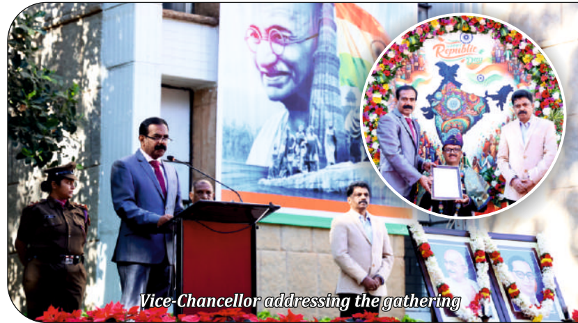
Vice-Chancellor addressing the gathering