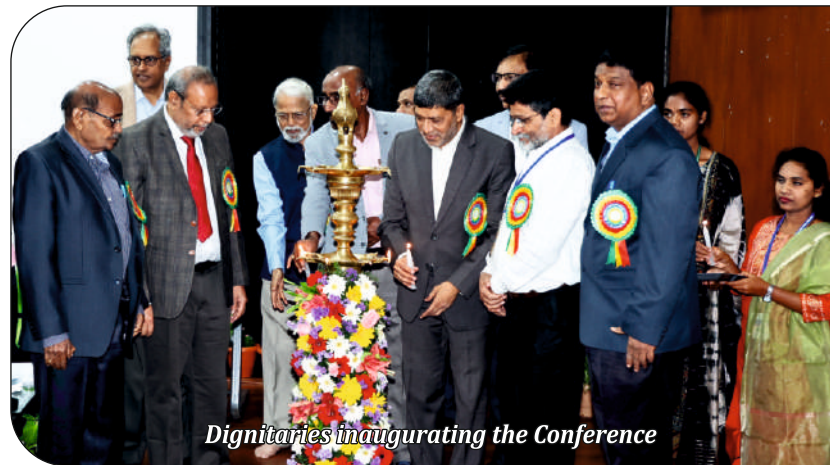
Dignitaries inaugurating the Conference