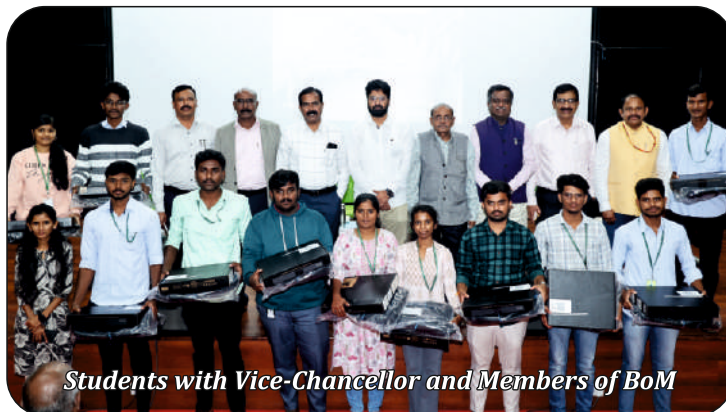
Students with Vice-Chancellor and Members of BoM

THE COLLEGE OF AGRICULTURE, GKVK, Bengaluru organised a Laptop Distribution Ceremony for SC/ST Undergraduate Students on 7 th January, 2025 at GKVK, Bengaluru. The event