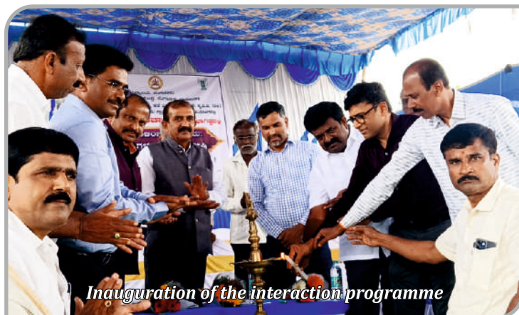
Inauguration of the interaction programme