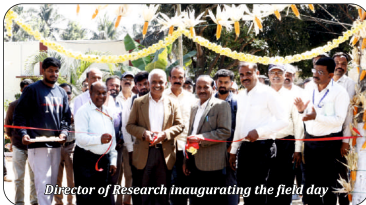
Director of Research inaugurating the field day

THE AGRICULTURAL RESEARCH STATION (ARS), Madenuru in partnership with the Bio-fuel Park, Madenuru organised the 'Golden Field Day-2025' on 29 th January, 2025. The event was